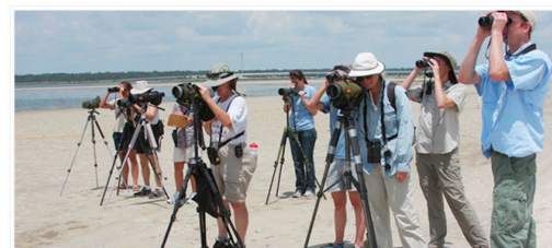
Monitors conducting a count at Huguenot Memorial Park.

Florida's Annual Winter Shorebird Survey starts on Friday, February 2nd, and continues through Thursday, February 8th. This week-long survey serves as the official statewide snapshot of coastal wintering shorebirds and seabirds in Florida. For the 2018 survey, FWC and partners updated the protocol and streamlined the sign-up process to make it easier to participate! Please check the FSA website and Facebook group in mid-January for more details and to participate. We hope you enjoy this fun and challenging winter survey and Thank You for your continued efforts!