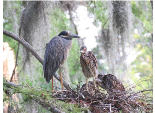
Yellow Crowned Night Herons